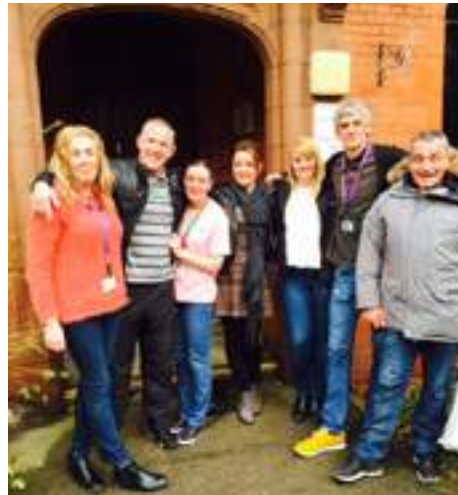
Trainees from Coolmine TC visiting Phoenix Futures Wirral Residential Service in the UK.

I attained knowledge of PF alcohol detox, Case management system; Funding and Family support service. I was particularly interested in the Family Support Service as I currently work in a mother and child facility. I gained good insight into their process regarding mothers being responsible for their own children (child protection – good practise), groups, process in regards to crèche and their case management system - All of which will be helpful to me in delivering a quality service in my own facility.