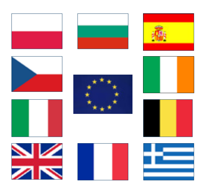
KNOWLEDGE EXCHANGE IS KNOWLEDGE CREATION